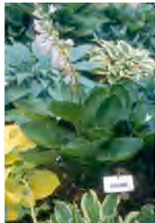
'Cup of Grace'