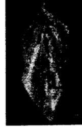
Fig. 1. Foliar nematode produces a wedge-shaped lesion in hosta and other monocots.

Although there are nematicides labeled for nursery use, these products are EXTREMELY toxic, especially to fish and wildlife, and are not available to the homeowner. Misapplication of these pesticides has been linked to death of hundreds of songbirds, fish and wildlife. It truly has no place in the home landscape.