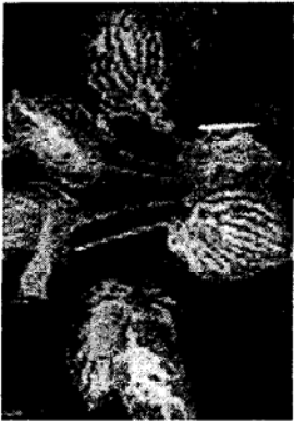
Hosta 'Breakdance' showing typical Hosta Virus X symptoms.

Hosta Virus X infected plants will not recover, so they must be prevented from spreading the disease to healthy hostas. If you have a virus infected hosta in your garden, it should be destroyed. Dig up the plant and send it to the landfill or burn it. HVX can not survive in the soil, so as soon as the infected roots remaining in the garden have decomposed you can safely plant another hosta in the same location.