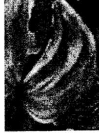
Leaves have patches or wedge-shaped areas of dead tissue.